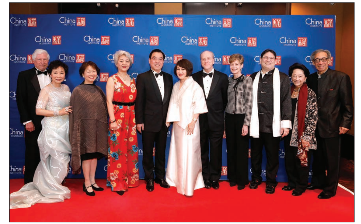
China Insitute's Blue Cloud Gala 2019

One piece of advice I would give is to not be afraid to fail. If you are willing to try and work hard, you will be surprised by what you can achieve. But if you fail, many lessons can be learned. It's win-win. So don't be afraid. •