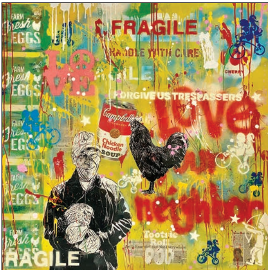
Love Your Neighbor