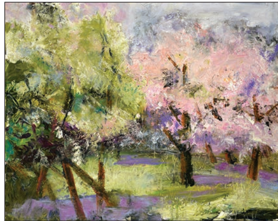
Trees in the Mist