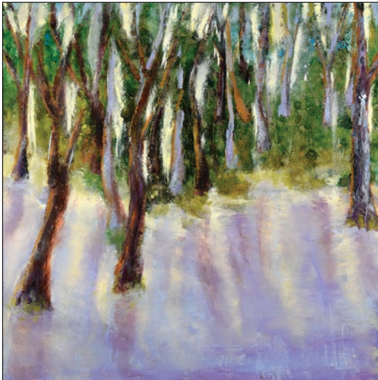
There Will Always Be Light