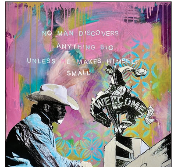
No Man Discovers Anything Big (Unless He Makes Himself Small)