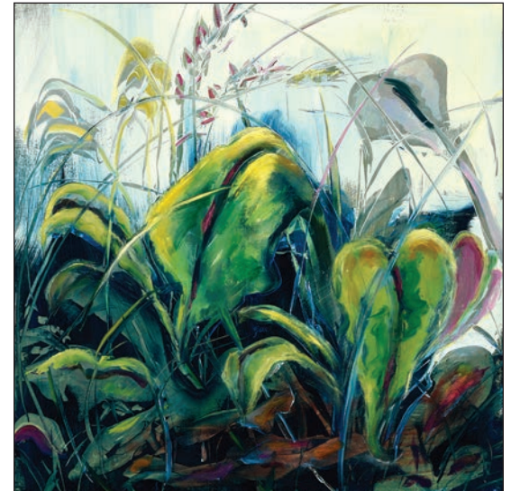
Leaves in the Morning Light