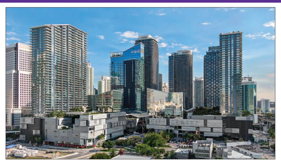
Brickell City Centre in Downtown Miami

The health and safety of our employees, our partners, and our customers was always our first and top priority. From there, we trusted the expertise and experience of our hardworking staff. Our teams embraced and adapted to new means of communication through technology platforms and acted with flexibility and empathy both interdepartmentally and with our external partners. Much like every business, across industries, some delays and setbacks were to be expected, but I'm proud to say that despite the unprecedented circumstances the business continued to push forward with meaningful growth, including the signing of new premium tenants like LUCID Motors, Indochino, and CH'I at Brickell City Centre – The Shops.