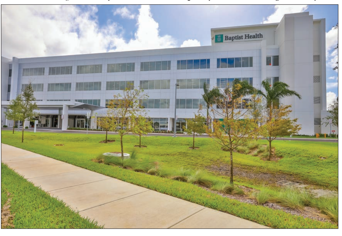
Baptist Health's wellness and medical complex in Plantation, Florida

You mentioned the pineapple logo for Baptist Health. Will you discuss the focus on hospitality and service throughout the system?