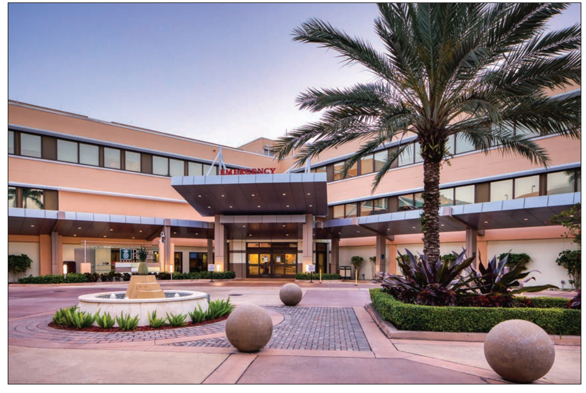
Doctors Hospital in Miami is also home to Miami Orthopedics & Sports Medicine Institute, a Center of Excellence at Baptist Health

My undergraduate degree is in accounting and I worked in a hospital while going to school, in the Dietary department, processing food orders and typing menus. When I finished school, I went to work as a compliance auditor for an insurance company that audited hospitals, so I was already working in the healthcare industry. I really enjoyed it and while I never wanted to be an operator running a hospital, I wanted to be in strategy to help shape a vision which is what I have had the privilege of doing at Baptist Health. I have been here for 33 years and what has kept me at Baptist Health are the people who I respect and admire, and when I see what we have done in the community, it is a source of pride for me to say that I am a part of this organization.