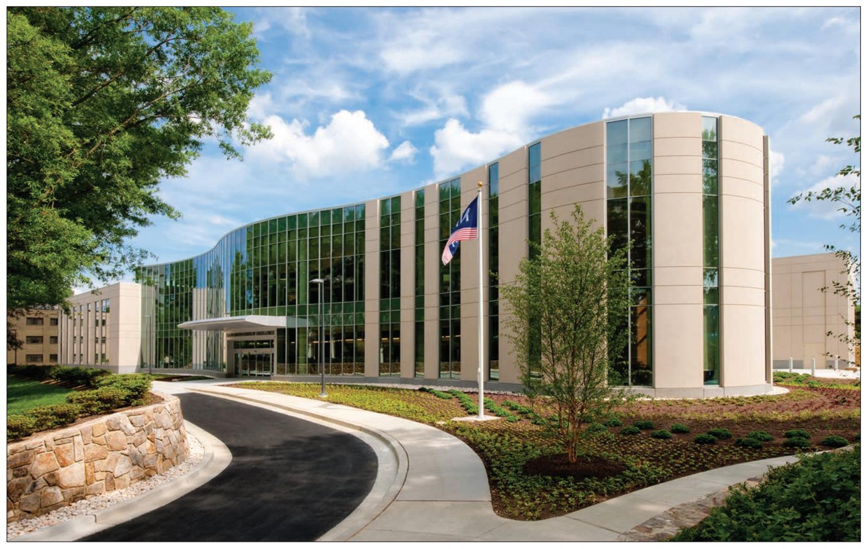
National Intrepid Center of Excellence (NICoE) in Bethesda, Maryland

I grew up being taught that all lives matter and that we all have unalienable rights – the right to life, liberty and the pursuit of happiness.