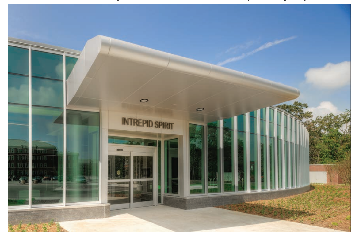
One of the nine Intrepid Spirit Centers the Intrepid Fallen Heroes Fund has developed to care for wounded soldiers