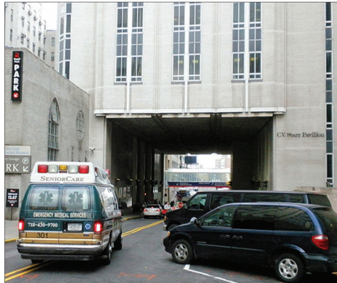
The Starr Pavilion at NewYork-Presbyterian Hospital

This is something that we have never seen before. I feel that you have to go back to World War l and the worldwide flu pandemic to have any real comparison. This is a global crisis and the numbers of people dying worldwide is staggering. We're struggling to understand the crisis, find a vaccine to prevent it and medicine