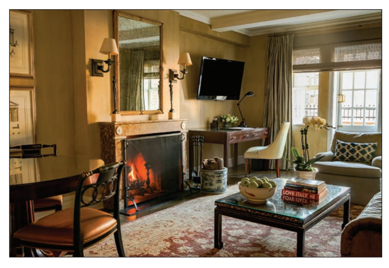
Two-bedroom suite living area

An Interview with Dina De Luca Chartouni