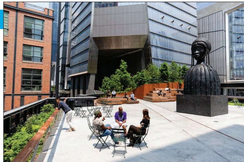
Various views of the 1.45-mile-long High Line on Manhattan's West Side