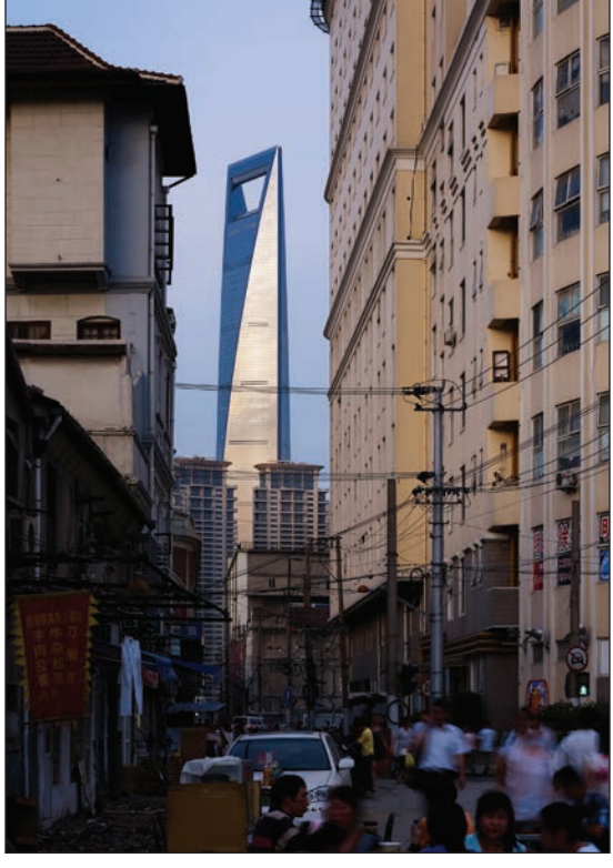
Shanghai World Financial Center in China

the feeling of the space, it can make you feel happy or sad, less tense or more tense. The work of architects affects so many people – these buildings that sometimes last 100 or more years, and the number of people who experience them, both from outside and inside, are affected by these buildings. If it's a really great building, it makes you feel good. It makes you feel good about yourself.