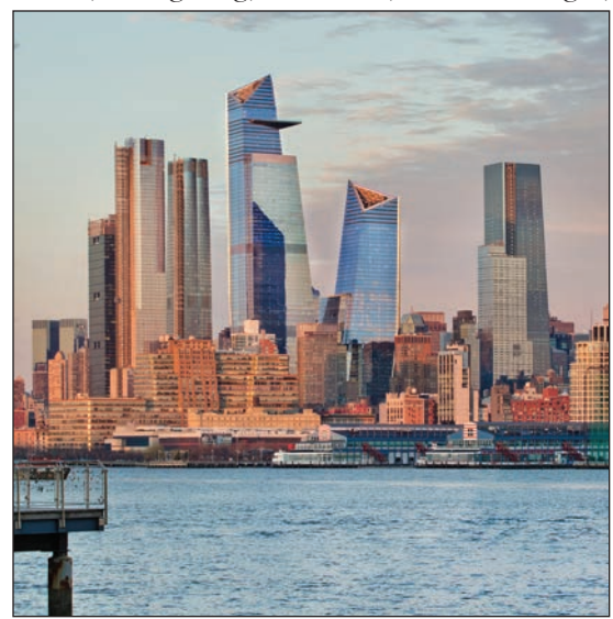
Hudson Yards on Manhattan's West Side

Buildings affect you every day: your office, your home, a hospital or a school. The way it works, the lighting, the colors, the natural light,