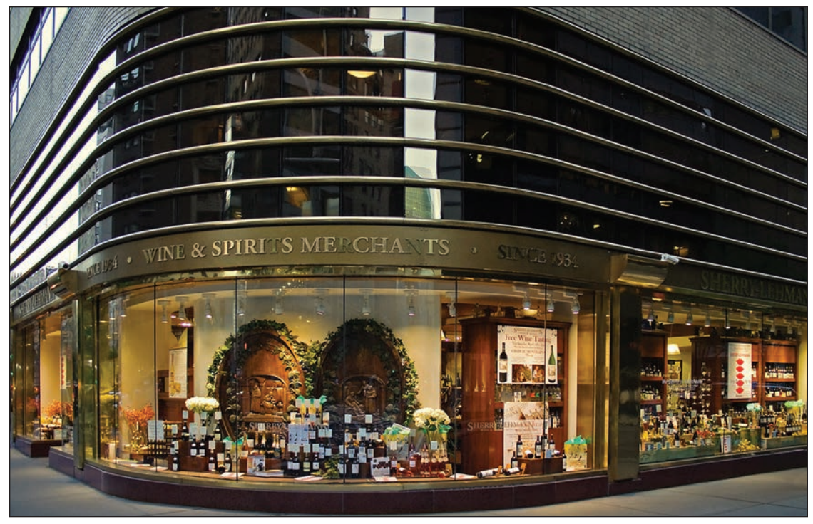
Sherry-Lehmann at 505 Park Avenue in New York City

We're all hard-driving and type A, but we like to have fun, and we love the product we're involved in. It's not an easy business – it's highly regulated and very competitive, so a passion for it is of great importance. If we keep the passion and the drive for success in our sights, we'll be just fine. ●