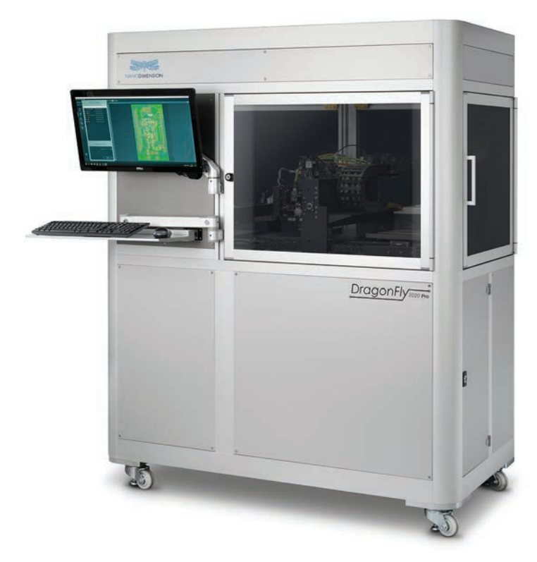
The Nano Dimension DragonFly Pro 3D Printer (above); 3D printing (lower left)

I obviously enjoy following my passions, but each company was really in a different field of activity: solar energy, whiskey, 3D printing. I do follow my passion, but I have never given up on something before I felt that I had come to the point where it can take off.