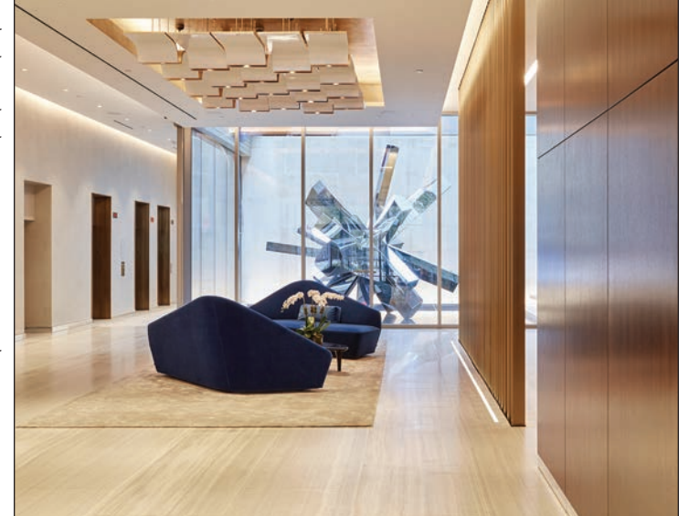
The lobby of Oskar, a Moinian building located at 572 11th Avenue at the intersection of the breathtaking new Hudson Yards and the rapidly transforming Hell's Kitchen

arm of our business, Moinian Capital Partners, has already placed more than $750 million into the market.