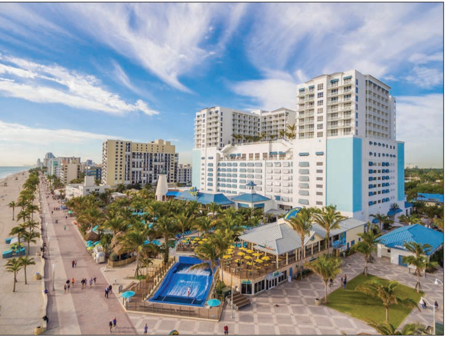
Margaritaville Hollywood Beach Resort, Hollywood, Florida

Cultural fit is everything, as we can teach aptitude, but we want to hire for attitude and a deep-seeded spirit to serve. We're very fortunate to have strong core values that support a very engaging culture which, in turn, have attracted some of the best talent in the industry. Nonetheless, we're in a period of declining unemployment, wages are beginning to rise and it's more competitive to access talent in the