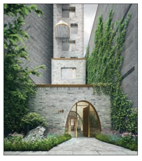
The entry to 180 East 88th Street.

One will often see significant portions of masonry in many of our buildings and a consistency in the flooring - it tends to be extremely warm and earthy. Those are the hallmarks of what one will notice. The green aspect is also almost a given for us in any project. The green is not just the right answer aesthetically, as everyone wants to look at something beautiful and organic, but also from an environmental perspective. All of those things come into play when we're looking at a project. Even with these consistencies, none of our projects look alike.