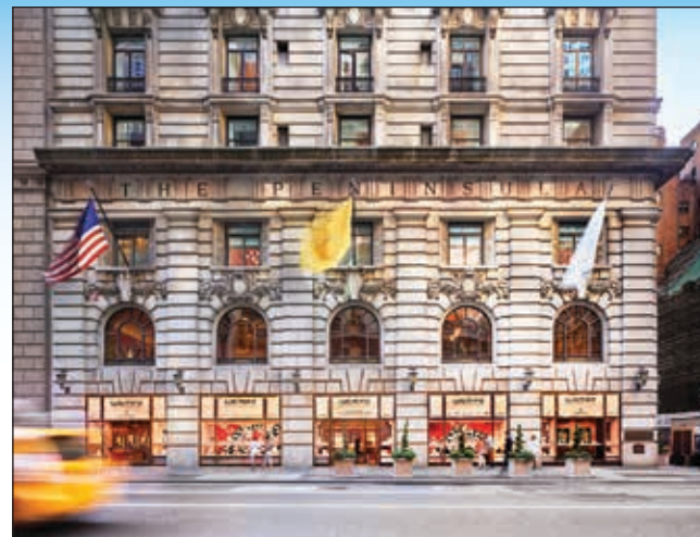
The exterior (above) and interior (left) of Wempe's flagship store at Fifth Avenue and 55th Street; exquisite ring and mechanical watch from the Wempe Atelier (below)