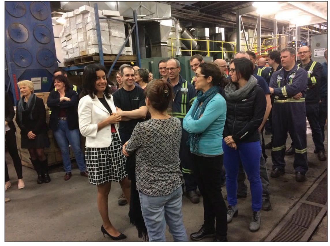
Minister Anglade with the workers of Prelco factory in Rivière-du-Loup, during the announcement of the modernization of the factory.

We are going to be launching a new science and research strategy soon and, in the fall, we will be launching the digital strategy, which is going to touch on different sectors. I am responsible for that, although it's not necessarily related to economic development.