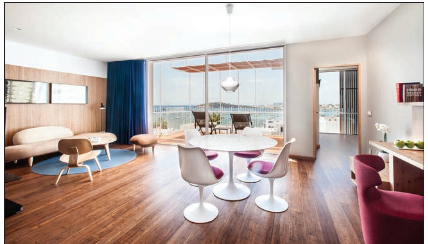
Clockwise from the top: Terrace pool and living/dining area of the Duplex Suite at OD Talamanca in Ibiza, Spain; Presidential Suite living area at the Washington Court Hotel in Washington, D.C.; the living/dining area and terrace with hot tub of the Penthouse Suite at the Grand Hotel Imperiale in Lake Como, Italy