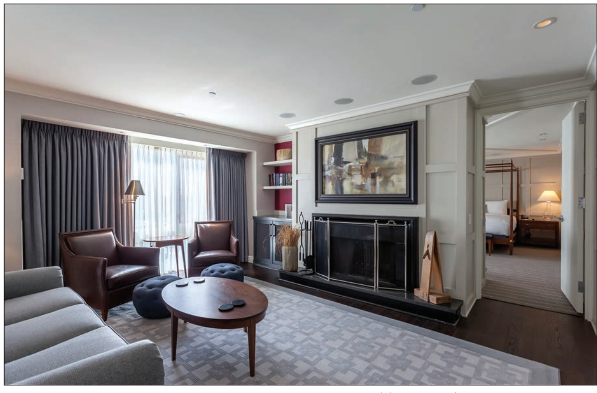
The Presidential Suite living area (above) and dining area (below)

The Charles Hotel underwent a $20-million property-wide guest-room renovation, completed in spring of 2016. The guest room renovation included new furniture, Carrara marble bathrooms, "smart sleeper" mattresses, an energy-saving light system, blackout curtains, and enhanced amenities like 55-inch TV screens and curated superfood minibars boasting goodies like yogurt-covered blueberries, spicy toasted walnuts, dark chocolate-covered acai berries, and kale chips.