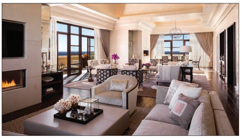
Clockwise from top left: Royal Suite terrace; Presidential Suite living area; Royal Suite dining area; Royal Suite media room; Presidential Suite sitting area