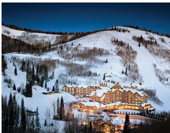
Montage Deer Valley in Utah (98)