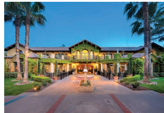
Hotel Los Gatos in Los Gatos, California (104)