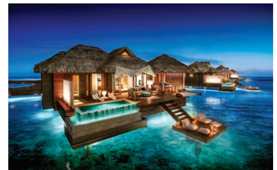
Over the Water Private Island Butler Villa with Infinity Pool at Sandals Royal Caribbean (100)