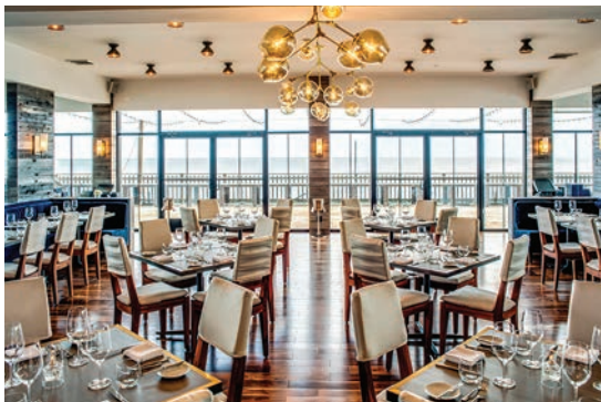
Scarpetta Beach (140)