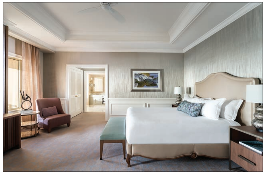
Clockwise from upper right: The Ritz-Carlton Suite living area, bedroom, and bathroom; The Sarasota Suite living area and dining area

No stay at The Ritz-Carlton, Sarasota will be complete without fully indulging in one of these luxurious suite options. \bullet