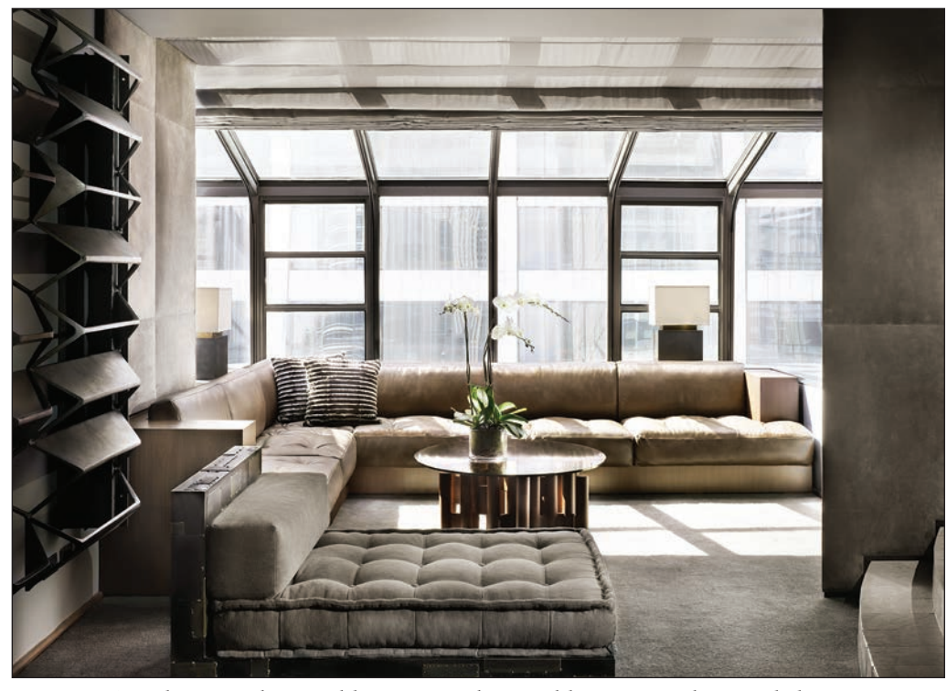
Top to bottom: Penthouse North living area; Penthouse South living area; Penthouse East bedroom

Philippe Stark's bold vision design welcomes guests into an iconic and more intimate Penthouse North featuring a stunning windowed so-