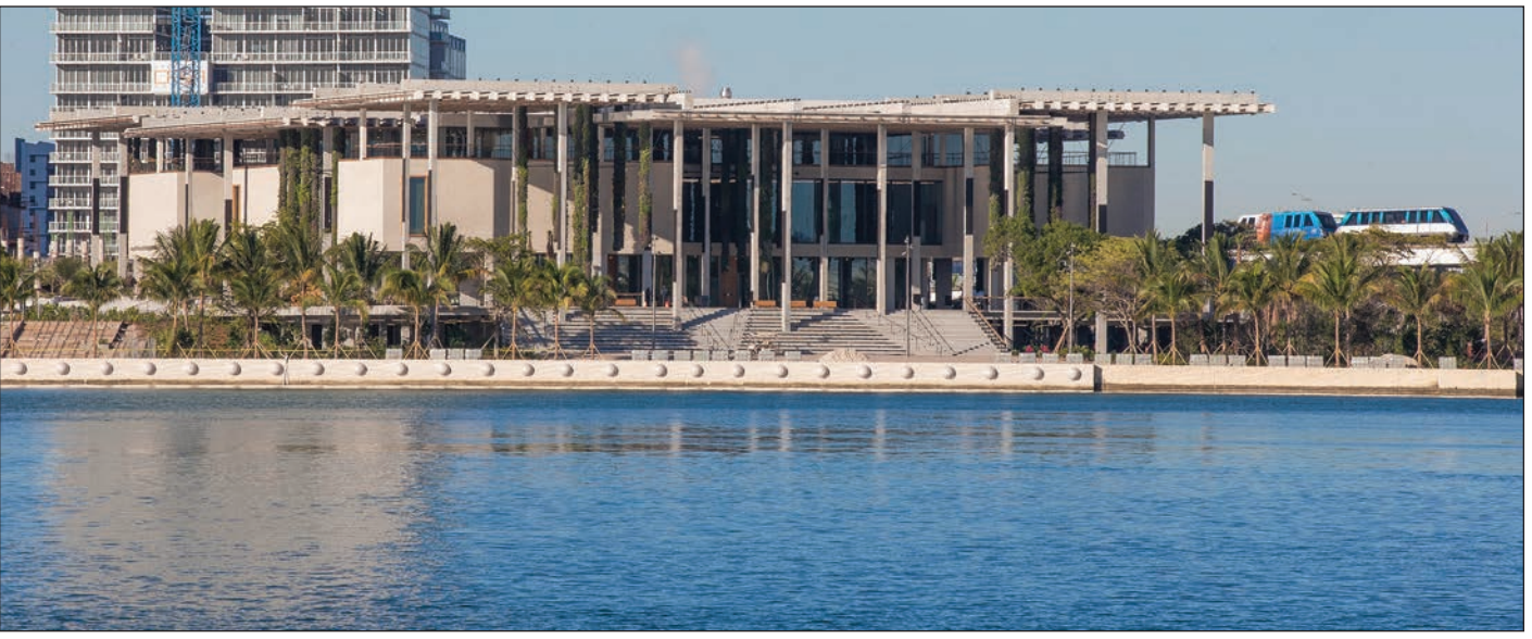
The Pérez Art Museum Miami

Both areas – business and philanthropy – make me very proud. I am very passionate about both. I'm proud of my employees and what they do. It's a sense of personal accomplishment,