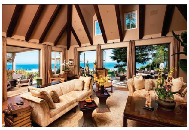
Breckenridge, Colorado's Sandara Place Living Room (left); Santa Barbara, California's Montecito Beach Estate living room (above)

Because we are focused on second homes in resort destinations, we differentiate strongly