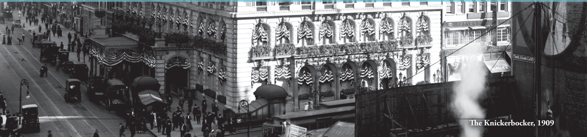
The Knickerbocker, 1909

The Knickerbocker is a haven of refined elegance; a treasured landmark among all Manhattan hotels. Built by John Jacob Astor IV in 1906, the hotel is now reimagined into a sophisticated urban sanctuary in the heart of New York City.