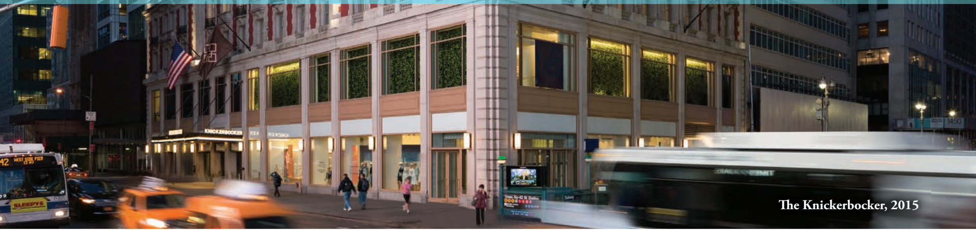
The Knickerbocker, 2015

The Knickerbocker opened February of this year as a luxury hotel located in the heart of Times Square. It boasts 330 spacious luxurious guest rooms, a state-of-the-art fitness center, a 2,200 square-foot event space, and upscale dining options.