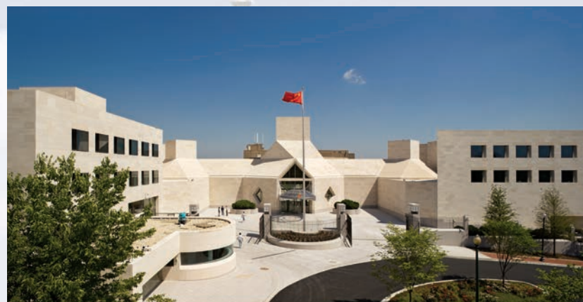
China Embassy Chancery Building

Shanghai Construction Group (SCG), is one of the leading construction company in China for over sixty years, it's public listed in Shanghai Stock Exchange Market since 1997. In 2014, Engineering News-Record (ENR) ranks SCG as the 11th among the top 250 Global Contractors, with annual revenue of $24.82 Billion.