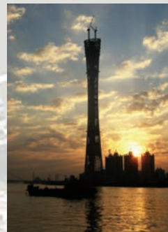
Guangzhou TV Tower