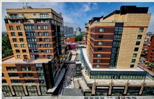
One Fulton Square - NYC