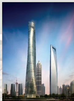
Lujiazui Financial Zone