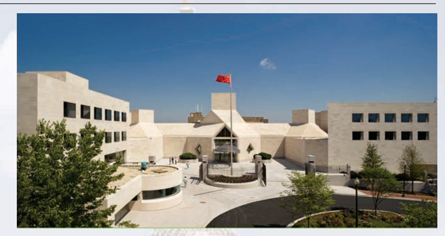
China Embassy Chancery Building

Shanghai Construction Group (SCG), is one of the leading construction Company in China for over sixty years, it's public listed in Shanghai Stock Exchange Market since 1997. In 2014, Engineering News-Record (ENR) ranks SCG as the 11th among the top 250 Global Contractors, with annual revenue of $24.82 Billion.