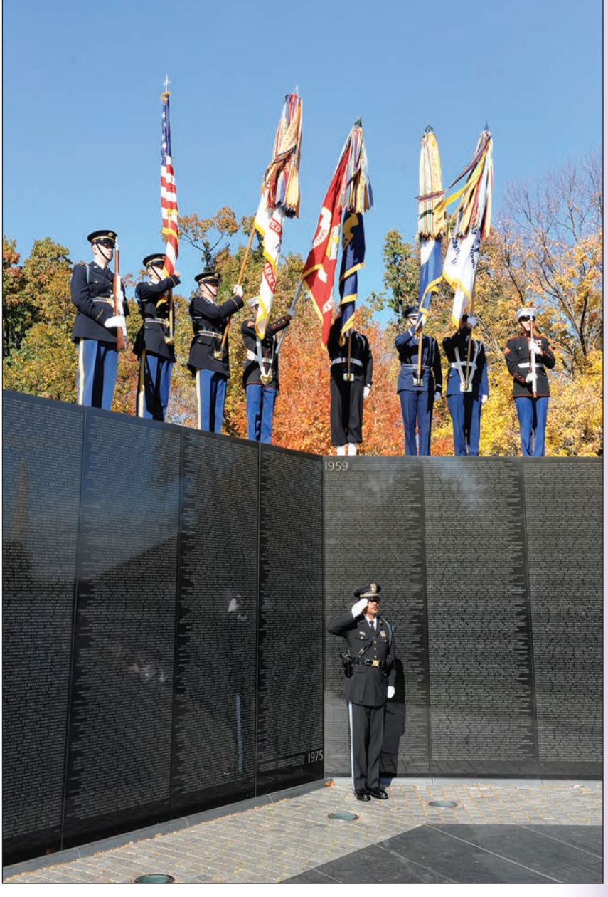
Veterans Day at the Vietnam Veterans Memorial in Washington, D.C. (above and next page)

We have a half-scale Wall replica that travels to 30-plus communities each year. We have a virtual Wall of Faces where visitors can post