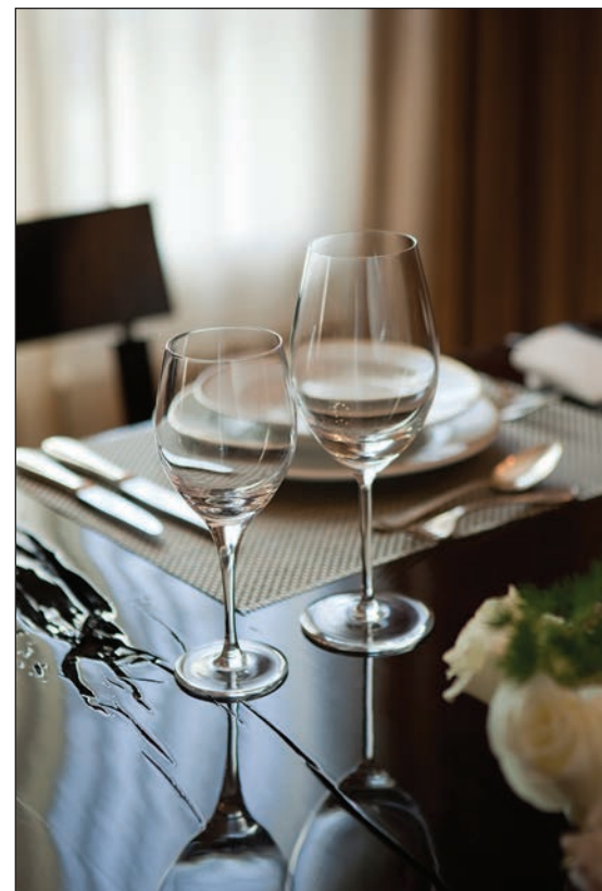
Details of the Owner Suite's living area, dining area, and bathroom

The scene is complete with the marvelous vista of the Avenida 9 de Julio, and its obelisk, peeping into the windows among perfumes of wood, lavender, and leather. ●