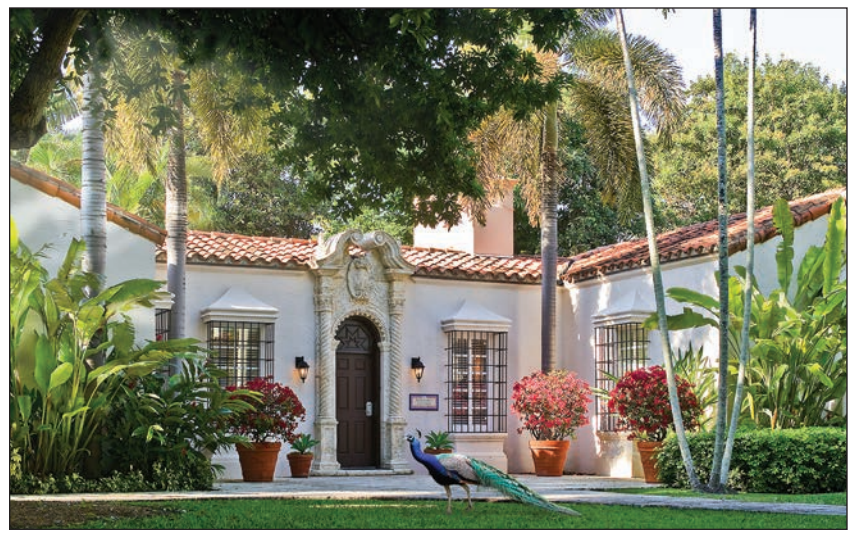
Rosemary's Cottage entrance (above); living area (left); bedroom (bottom left); and bedroom (bottom right)

upstairs snooker club with billiard tables; a superb 24,000-square-foot spa and fitness center; an upscale gourmet market; an aviary with flamingos and exotic birds; a bank; polo grounds; a private day school (Pre-K through fifth grade); a dog park; a post office; and a fire and rescue station. Additionally, the Club is a member of The Leading Hotels of the World.