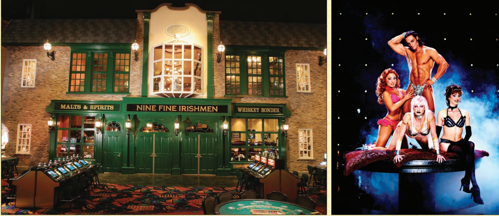
POSTED WITH PERMISSION. COPYRIGHT © 2013 LEADERS MAGAZINE, INC.

New York-New York exterior (top left); Nine Fine Irishmen restaurant (bottom left); Zumanity, a Cirque du Soleil show at New York-New York (bottom right)