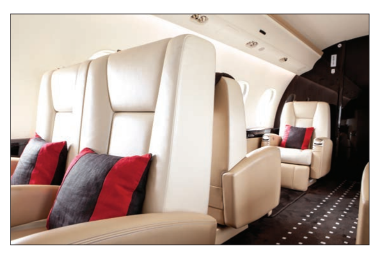
The interior of one of VistaJet's Bombardier Global 6000 aircraft

Our revenue growth in 2012 was 26 percent in terms of true flight revenue, which proves that more people are appreciating our concept. Are we a solution for everybody? No, but we're sticking to our business model because there is a market for people who realize that, for a relatively small increase in price, they can fly with a company that only uses Bombardier for maintenance and uses brand new replacement parts.