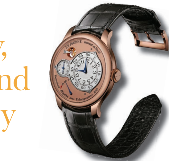
The design (left) and execution (right) of the Chronomètre Optimum