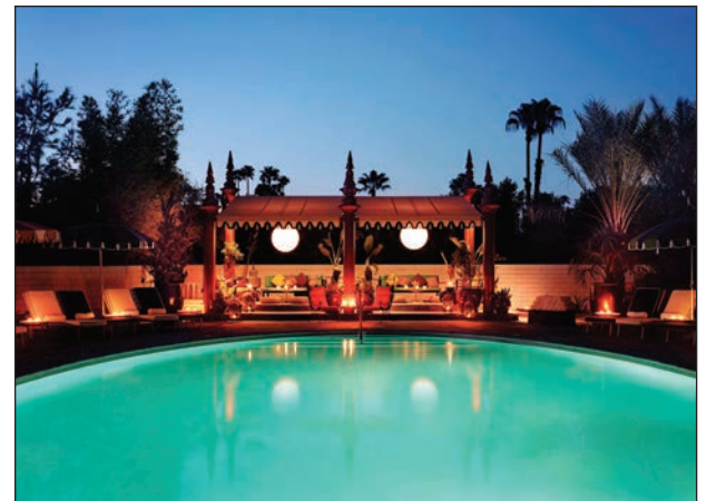
Left: Le Parker Meridien entrance, lobby entrance to Norma restaurant, and the rooftop pool; Right: Parker Palm Springs entrance, grounds, and pool