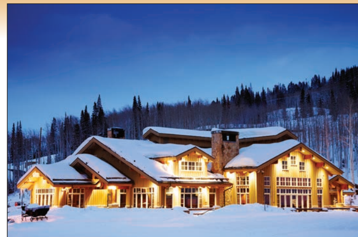
Family skiing at Deer Valley Resort (left) Empire Canyon Lodge at Deer Valley Resort (right)