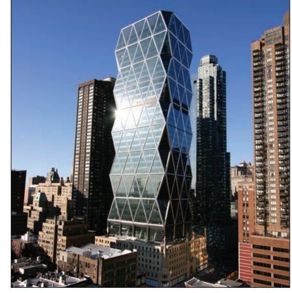
The Hearst Tower on Manhattan's West 57th Street

What happens is that innovators outside the company show up on our doorstep. Not only do we get innovation from our own people but we constantly have people who want to come to Hearst and help us innovate further.