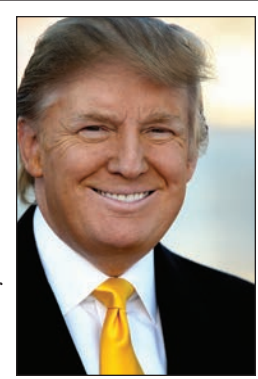
Donald J. Trump

Trump represents the gold standard worldwide; it's an automatic connection to the highest level of product on every level. Our hotels are noted for superb service as well as cutting-edge amenities and beautiful design. The public doesn't have to second guess what they're getting for their money. What makes our brand so special is our unwavering commitment to being the best – we set our own standard and we meet it by being superior to any competitor on every level. If it's not the best, it's not Trump.