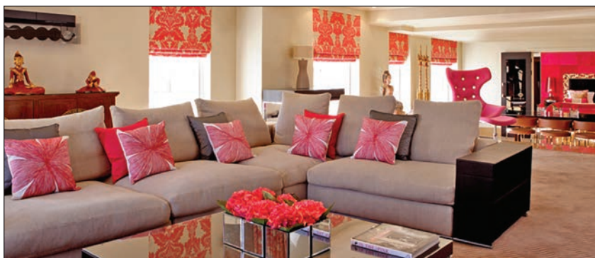
Ebony Suite living area and balcony (top row); Schiaparelli Suite living area and bedroom (center row); Penthouse Suite living area and balcony, and bathroom (bottom row)

Elegantly positioned on the 9th floor of the hotel, The Penthouse Suite offers over 2,100 square feet of space and includes a decked terrace with panoramic views of London; a master bedroom with double dressing room and king-size double bed; a bathroom with a marble bath, LCD TV, and illuminated rain shower; a second bedroom with a circular revolving bed and en-suite bathroom; 42-inch Bang & Olufsen plasma TVs in both bedrooms; a lounge with an integrated fireplace and a curtain and lighting system; 65-inch Bang & Olufsen plasma TV and Bang & Olufsen CD player with MP3 connectivity; a dining area with full-size 10-seat dining table; a kitchen for entertaining; and CCTV entry controls. An array of indulgent services for guests include 24-hour butler service including pre-arrival arrangements, shoe-polishing, packing and pressing services, and in-room dining; six bottles of house wine; and fresh flowers. ●