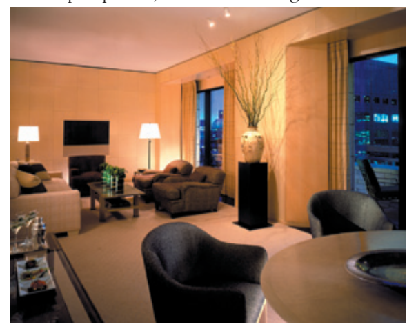
Clockwise from upper right: Presidential Suite living area; Royal Suite living area; Terrace of the Ty Warner Suite; Ty Warner Suite living area; Presidential Suite living area fireplace