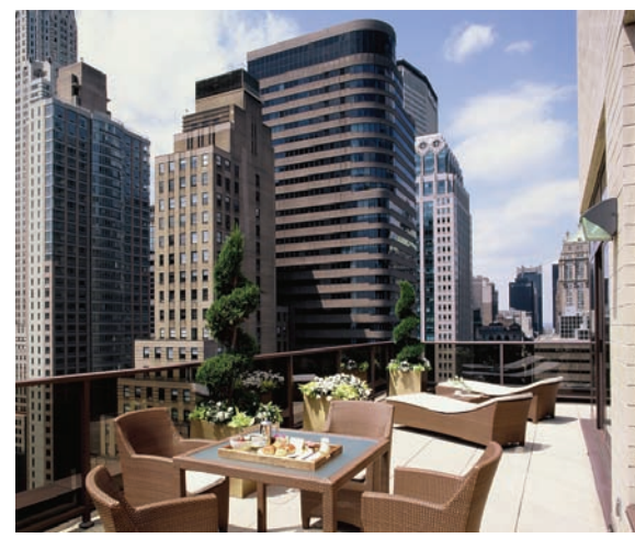
Clockwise from the top left: Penthouse view; suite work station; Mary Lou Pollack; Riingo Restaurant; Penthouse terrace; lobby fireplace; suite living room with full kitchen