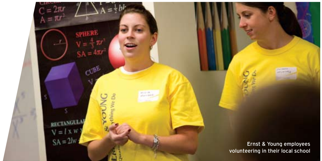
Ernst & Young employees volunteering in their local school

communities everywhere achieve their full potential as the very essence of that mission. In this world, we are all connected, and Ernst & Young and its people are doing everything in their power to make that world a more hopeful place. ■