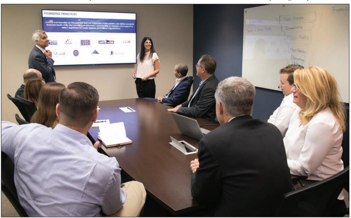
Collaborating at Anchor Trading's corporate headquarters in New City, New York

We are very proud of these accomplishments, but we could never have done it without our clients and a team that leads with their hearts in everything they do. While