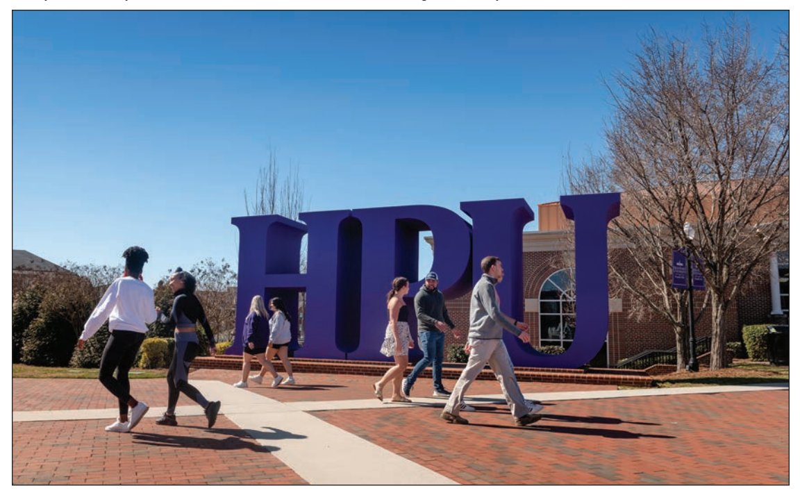
Students on the HPU campus

I saw an opportunity to plant seeds of greatness in the minds and hearts of young people who would go on to become leaders in our world. When I first arrived, HPU was what one journalist called a "dusty old college." I saw its potential to be a differentiator in the world of higher education. I wanted to take HPU from an ocean of sameness to a much smaller lake of differentiation, as I had helped major corporations do that in my business career. With a phenomenal group of faculty and staff, we rolled up our sleeves and got to work. We didn't just think outside the box - we threw the box outside the window. This is sometimes hard to do, especially in higher education where so many small colleges have traditionally operated by the same formula.