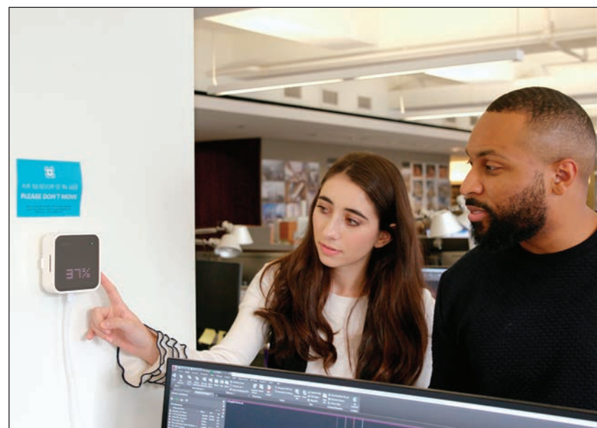
Members of KPF’s Green Design, Resilience, and Wellness (GRoW) group monitor air quality sensors in the firm’s New York office.

The firm has joined AIA, RIBA, and many of its peers in a joint effort to develop the capabilities to design and deliver carbon-neutral buildings by 2030. Our sustainability mission includes our campus and community as we endeavor to achieve operational carbon neutrality by minimizing our energy, water, and waste impact and investing in the World Wildlife Fund’s Climate Crowd and Alliances for Climate Action programs.