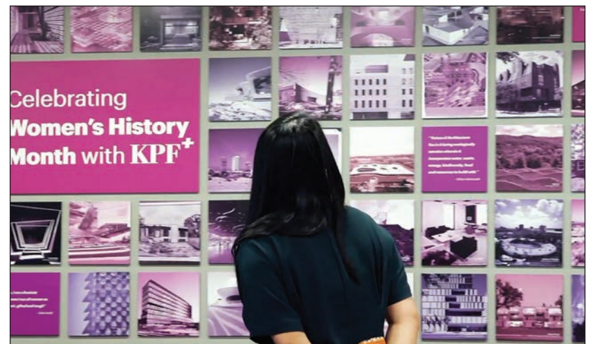
KPF+ curated a month-long installation in the New York office to celebrate Women's History Month 2020.

For more than 20 years, KPF has been an active leader and sponsor of the ACE Mentor Program of America in New York City. We do this to ensure we expand awareness of, and access to, opportunities within the profession to the next generation of architects. Each year, a committed team of KPF staff leads a series of after school sessions for a diverse group of local high school students interested in exploring careers in architecture, engineering, and construction. We work through hypothetical projects together, along with our colleagues on the developer side as well as our ACE partners, to simulate the roles we each play in the industry.