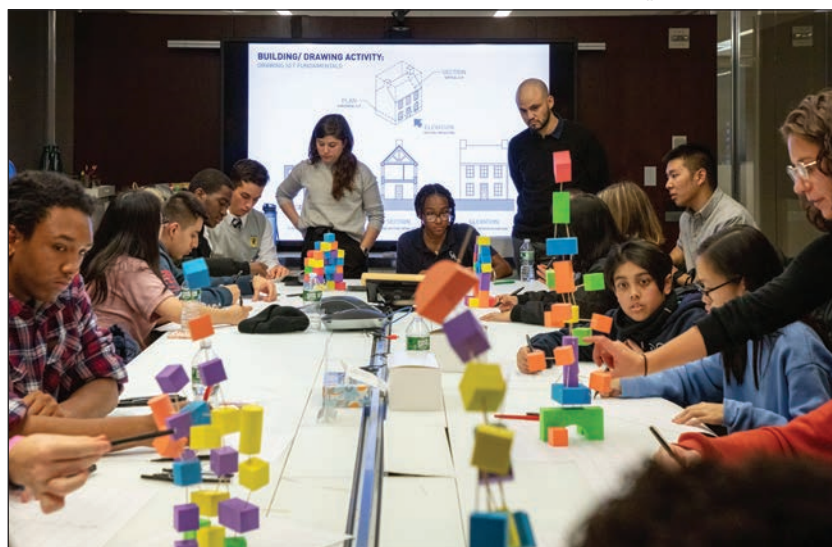
Through the ACE Mentor Program of America, KPF staff advise high school students with aspirations to pursue careers in design and construction.

More and more, our architectural community seeks to fulfill the higher goals of our profession - servicing not only our clients and building users, but also the general public and the planet. As we begin sketching the solution for any new project, we ask ourselves about the “externalities” of a given design solution. The challenges of dealing with climate change, health threats, social inequality and lack of accessibility to public benefits are monumental in scale, but by beginning with concrete and tangible measures, our work can make incremental differences. ●