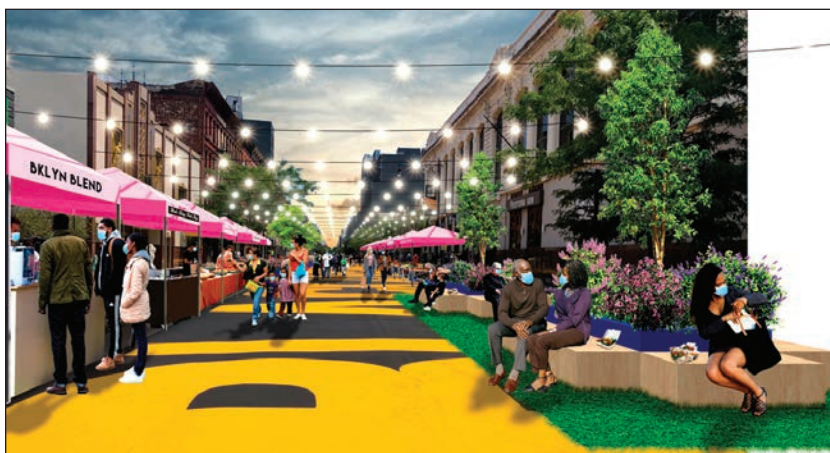
KPF, with support from KPF Public, joined the Bedford-Stuyvesant Restoration Corporation and design partners to create public space as part of the Neighborhoods Now program to channel pro bono resources from New York-based design firms into community-driven COVID-19 recovery strategies.