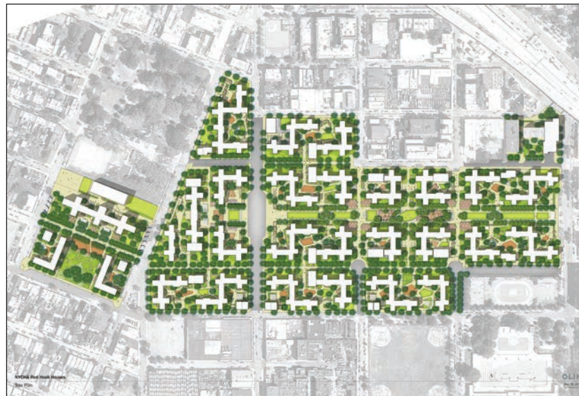
KPF's resiliency plan for the NYCHA Red Hook Houses creates pedestrian spaces, courtyards, and playgrounds, and aids in wayfinding.

time to build trust and to better understand their needs. At NYCHA Red Hook Houses in Brooklyn, we held numerous workshops with residents, elected leaders, parents, and even children, in order to craft a design for the public spaces that was both resilient and usable. Our plan improves building entries and site lighting, creates pedestrian spaces, courtyards, and playgrounds, and aids in wayfinding across this large expanse of repetitive, circa 1930s structures.