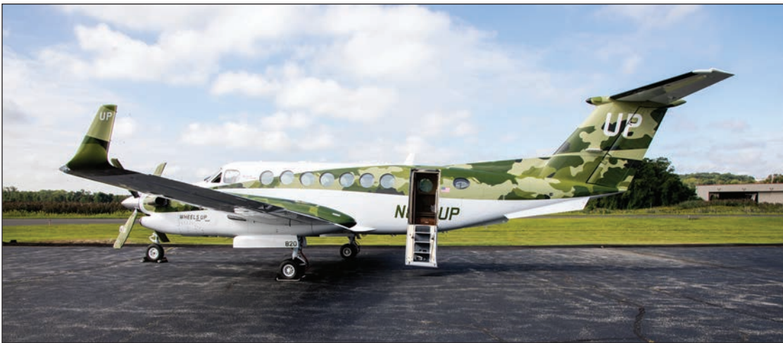
Wheels Up Cares Camouflage Plane for the Tragedy Assistance Program for Survivors (TAPS)