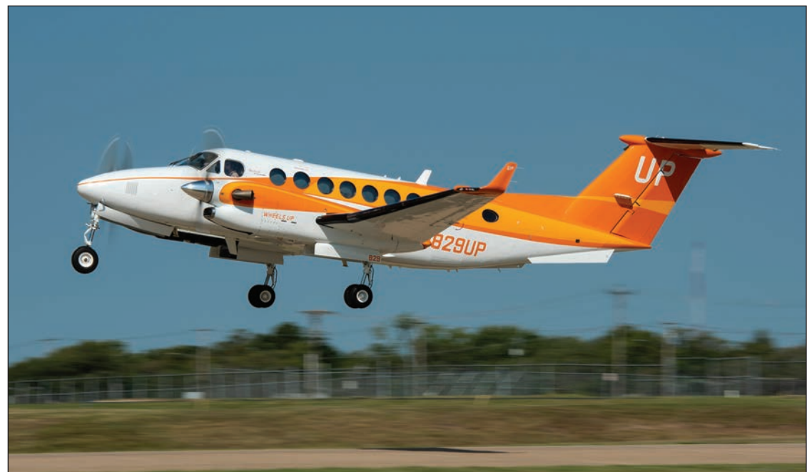
Wheels Up Cares Orange Plane in honor of Feeding America's Hunger Action Month

COMPANY BRIEF Wheels Up (wheelsup.com) is the only company in the industry to offer a total private aviation solution that includes world-class safety, service, and flexibility through on-demand flights, membership programs, corporate solutions, aircraft management, whole aircraft sales, and commercial travel benefits through a strategic partnership with Delta Air Lines. Wheels Up offers its Customers and Members access to over 1,500 safety-vetted and verified aircraft. Through the Wheels Up App anyone can search, book, and fly. Wheels Up Connect, Core and Business memberships provide enhancements such as flight sharing, empty-leg Hot Flights, Shuttle Flights, Shared Flights, signature Wheels Down events, and exclusive member benefits from preeminent lifestyle brands. The company's ongoing Wheels Up Cares program aligns with philanthropic organizations and initiatives that affect and matter to the company and its customers, members, stakeholders, families and friends. The Wheels Up Cares fleet is comprised of five custom painted Beechcraft King Air 350i aircraft – each plane serves as a flying symbol for a specific cause.