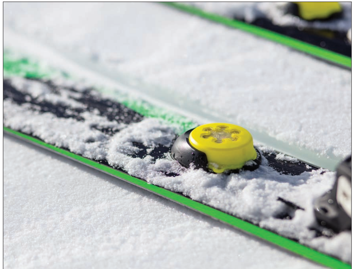
The SKEO app records skier performance, including from optional wearable sensors, and gives the skier real-time feedback and instructions to improve performance and safety