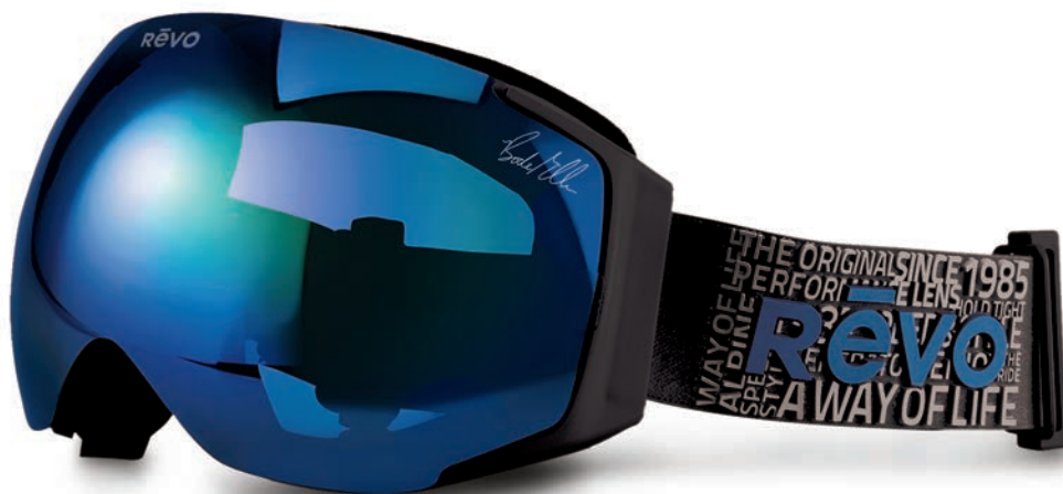
Revo x Bode Miller No 1 Blue Water lens