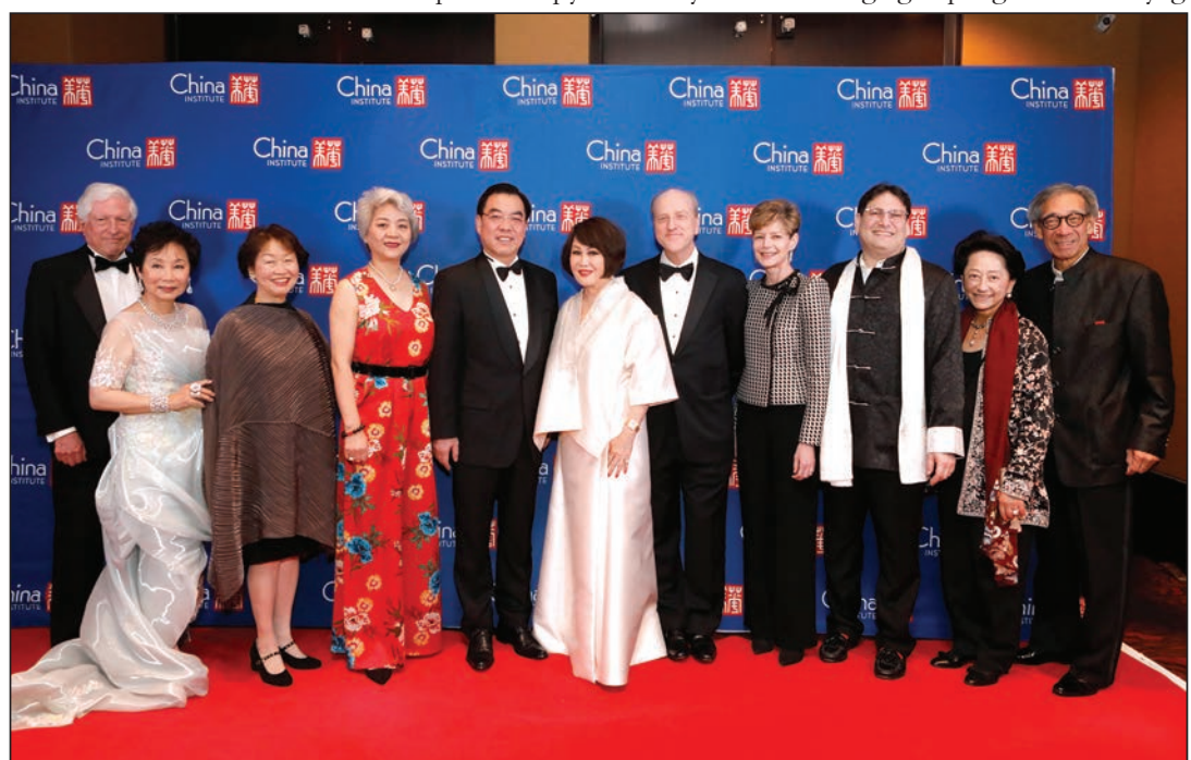
China Insitute's Blue Cloud Gala 2019

A strong leader can build a strong team and motivate and guide them to success. To be successful in philanthropy is actually more challenging