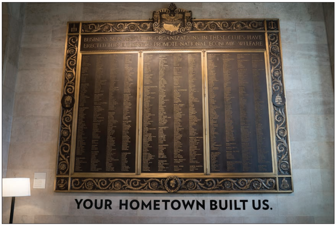
A 12-foot-high bronze plaque at the U.S. Chamber of Commerce beadquarters honoring those small business leaders who built the organization

When you are dealing with these types of long-term challenges and complex issues, what is the approach the Chamber is taking to drive results?