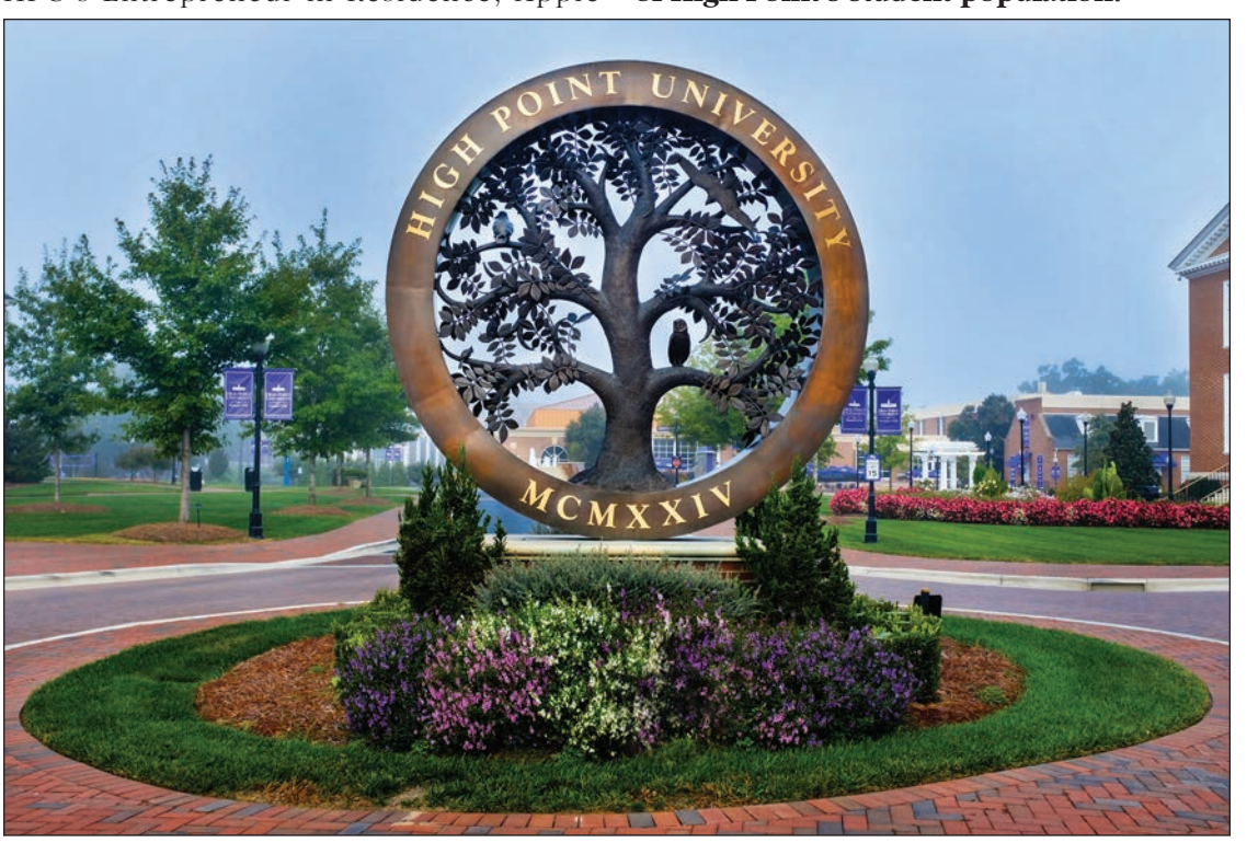
High Point University's campus includes dozens of sculptures as part of their inspiring environment

Leaders strive to create capacity in others. For students, I teach a class to all freshmen titled, "The President's Seminar on Life Skills," sharing the principles, skills and values that one must apply to succeed in an ever-changing world. I remind faculty and staff on campus, "We live, students watch, and students learn," because students are paying attention to our actions. They need heroes, models and mentors to positively influence their lives and actions. You have to live the example for them to follow. ●