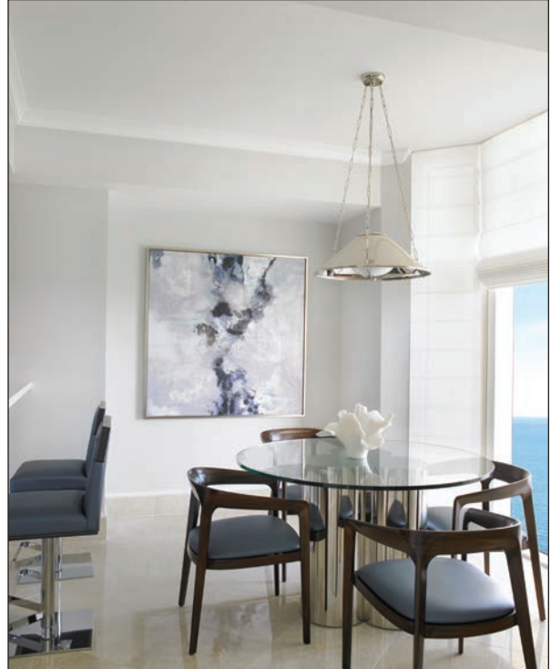
Acqualina Resort & Residences on the Beach Grand Deluxe Three-Bedroom Oceanfront Suite living area (top); bedroom (lower left); and dining area (lower right)